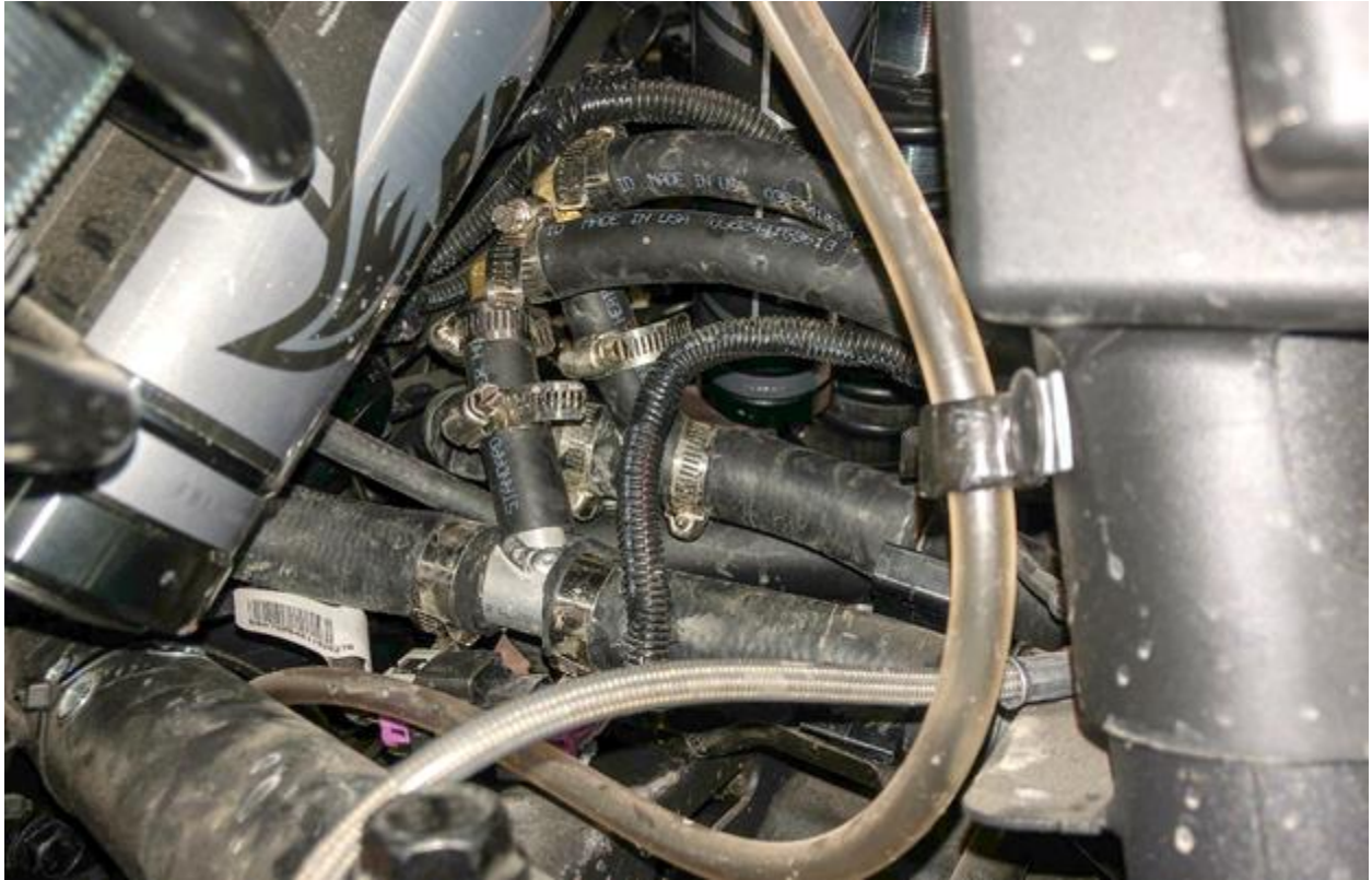
PIC05 – DRIVER SIDE WHEEL WELL